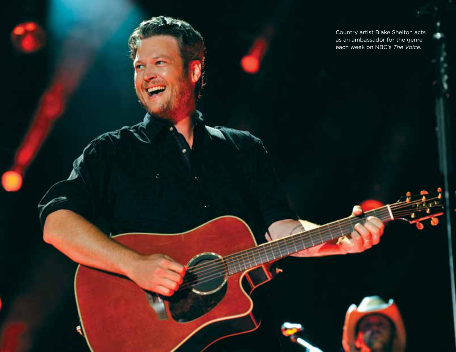
Country artist Blake Shelton acts as an ambassador for the genre each week on NBC's The Voice .